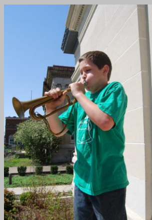
100 TH ANNIVERSARY

Lots of new information has been posted on the number one ranked Scout Troop in the world by Google. Check it out!