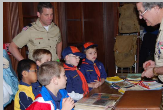
100 TH ANNIVERSARY