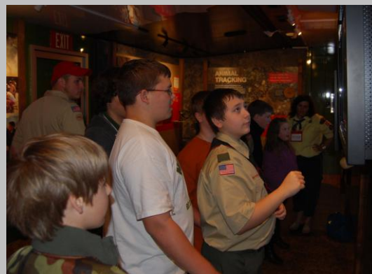
Adventure Base 100