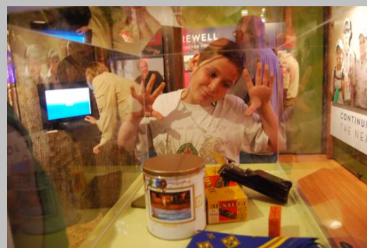
ADVENTURE BASE 100

Lots of new videos and photographs have been posted on our highly rated troop website. Check it out!