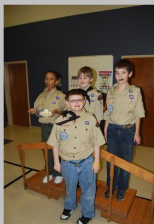
PACK 9 WEBELOS CROSS-OVER

Lots of new information has been posted on the number one ranked Scout Troop in the world by Google. Check it out!